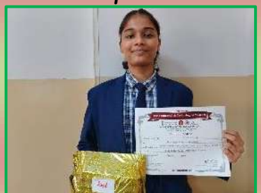
Competition- Vigilance Awareness Week

P.B. Academy School- Inter School Science Fest- 2<sup>nd</sup> prize Coding and Chemistry, 3<sup>rd</sup> prize Mathematics