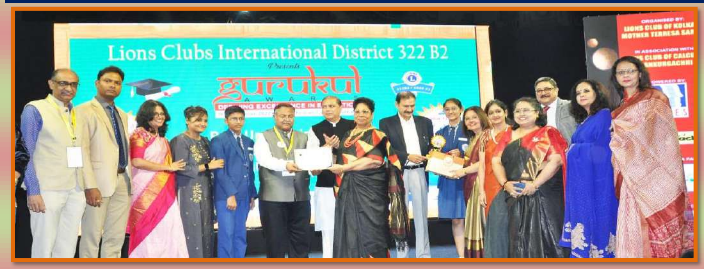
BITM- 2nd prize Elocution

10<sup>th</sup> LIONS GURUKUL AWARD FOR 'THE BEST UP-COMING SCHOOL' AWARDED TO BIRLA HIGH SCHOOL MUKUNDAPUR