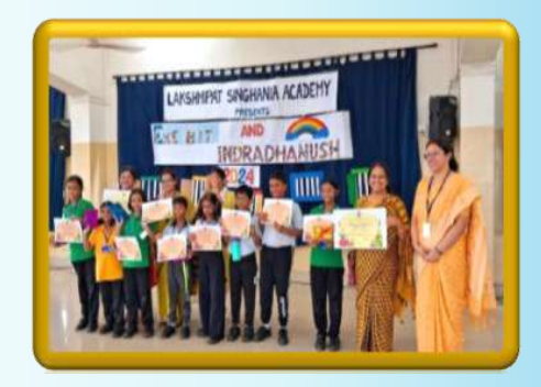
Indradhanush -organized by Lakshmipat Singhania Academy