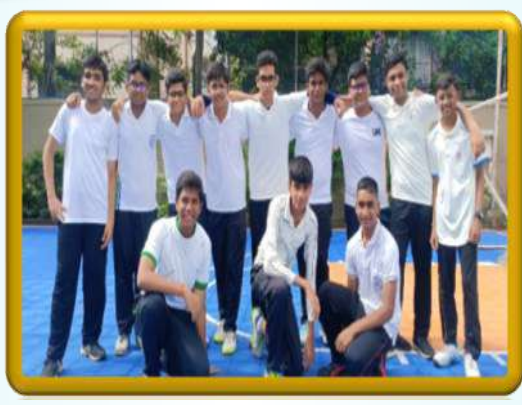
Sanglaap – a Literary Meet hosted by The Heritage School.