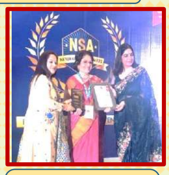
Life time Achievement Award