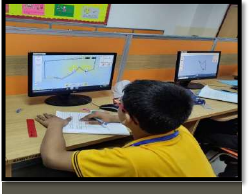
The flow of electrons and electric currents made vivid by the students of Class VI.