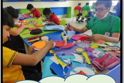
Global Logo Hunt: Class VI mapped out G20 countries with creativity! Spotting, locating, and conquering the co-ordinates.

Students of Class VIII worked their way towards creating a working model of Squares and Square Roots.