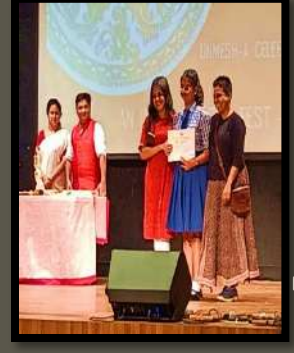
Our school participated in an Inter-School fest "Unmesh 2023" and won 2nd position in Rabindra Nritya and Creative Writing. We also received the overall 2nd position in this fest.