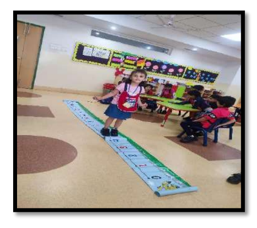
Young stars of Kindergarten enjoyed counting through the Number Line Activity as well as indulged in a Community Helper Roleplay with elan.