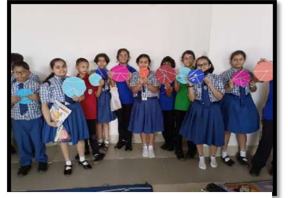
Learning becomes fun when theory translates to practical as exhibited by the exuberant ones of Class VI.

Subjects are taught to empower students to think for themselves, to consider matters and to take part in the art of attaining knowledge. Knowing is a process, not a product.