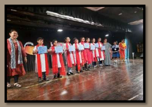
Raman House conducted the Inter-House Singing Competition on 21<sup>st</sup> June, 2023 in the school campus for Classes III – X. The students of Kalam House were declared winners.

The Inter-House Tug of War competition was held for students of Classes III & IV. Raman & Sarabhai House took the trophy home.