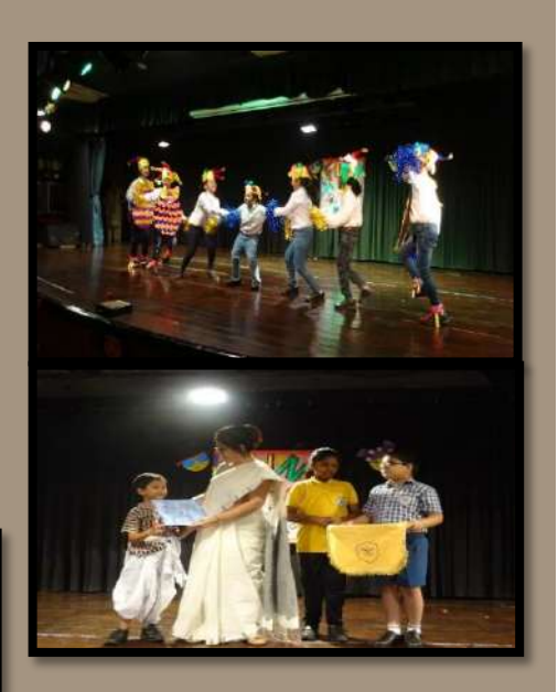
The Inter-House Dance Competition was held on 5<sup>th</sup> May, 2023 in the school campus for Classes III - X. The students of Kalam House were declared winners.